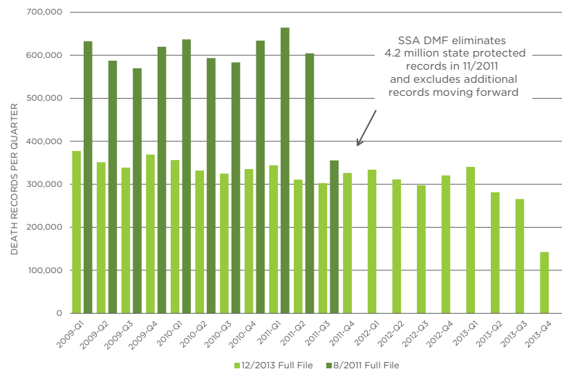
SSA DMF Comparison Between 2011 and 2013 Full Death Files Quarterly Record Counts